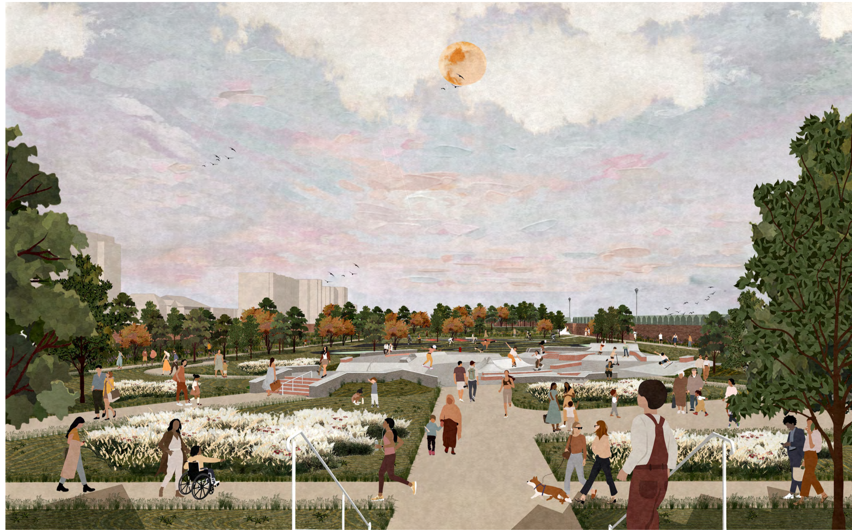
Artist's impression, view from east down new access steps into the Skate Plaza / Pump Track / Roller Rink