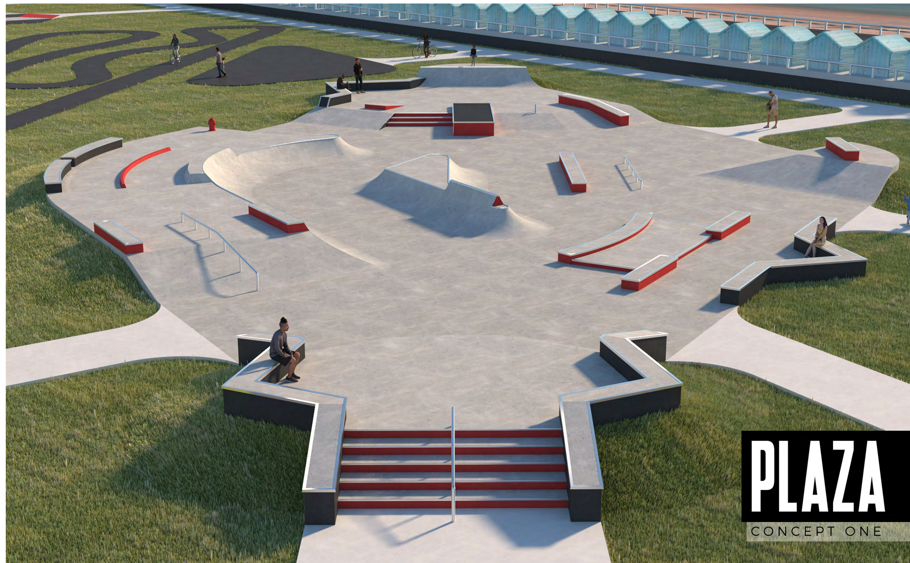
Designer's impression, view of new skate park plaza concept - a uniquely accessible design for all users, specific to West Hove as the outcome of detailed stakeholder consultations, this new facility will encourage young children and learners, with family participation, as well as older peers