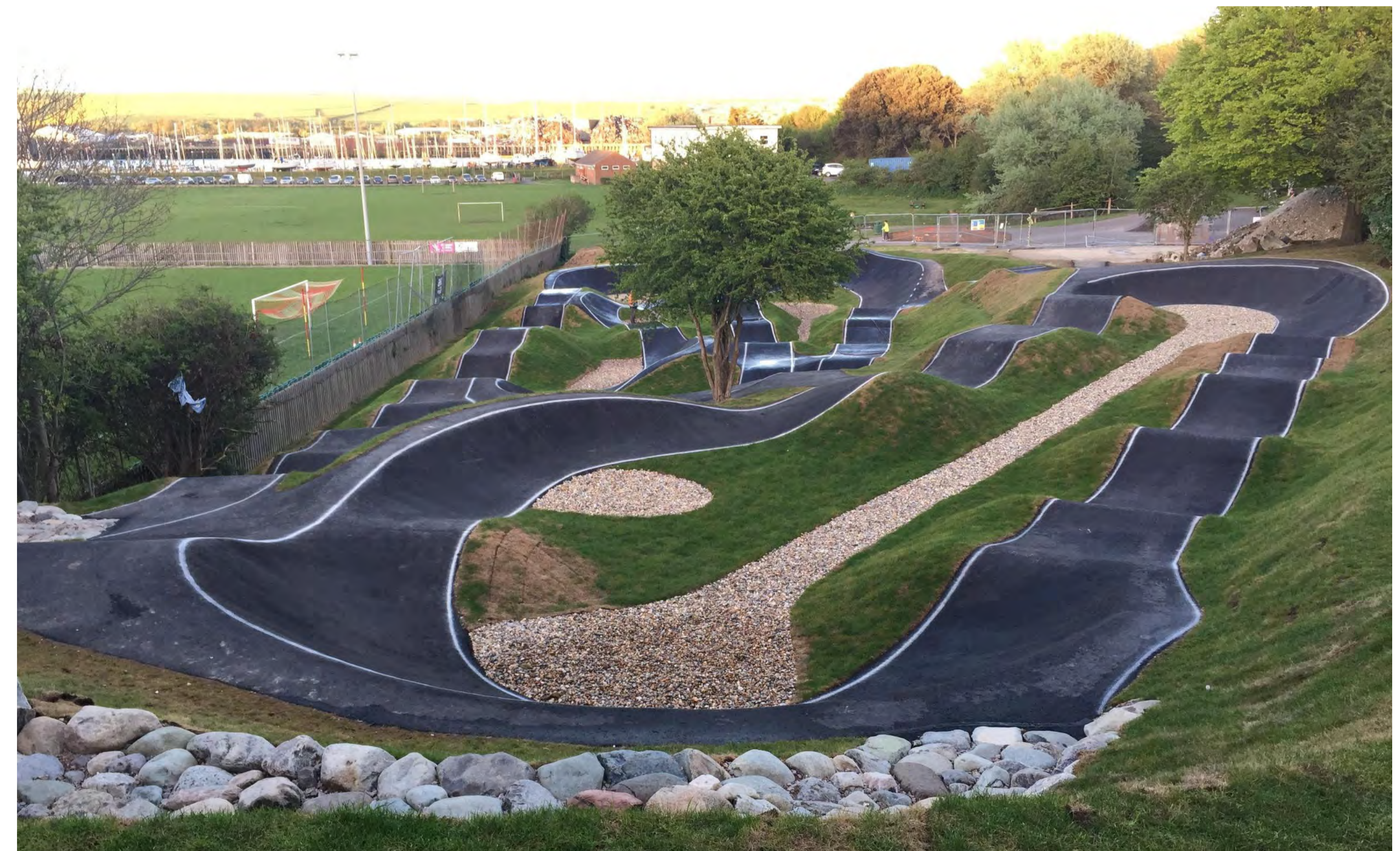
Pump Track precedent showing integration of track with landscape (Newhaven)