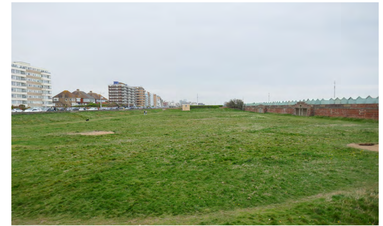
Under-utilised and inaccessible public realm of old Pitch & Putt space (west)