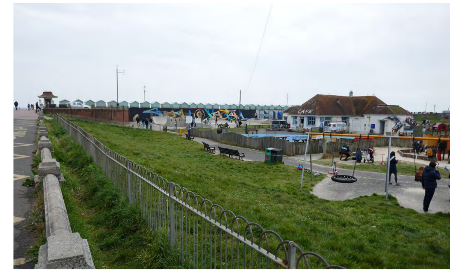
Existing eastern approach to the Big Beach Cafe is inaccessible