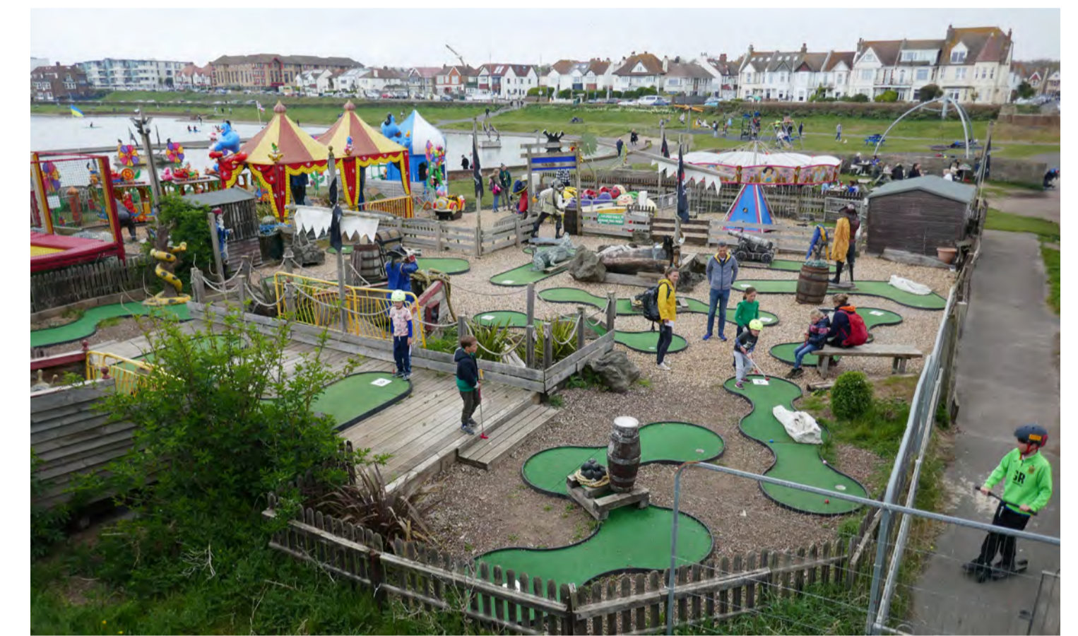
Existing Amusements area