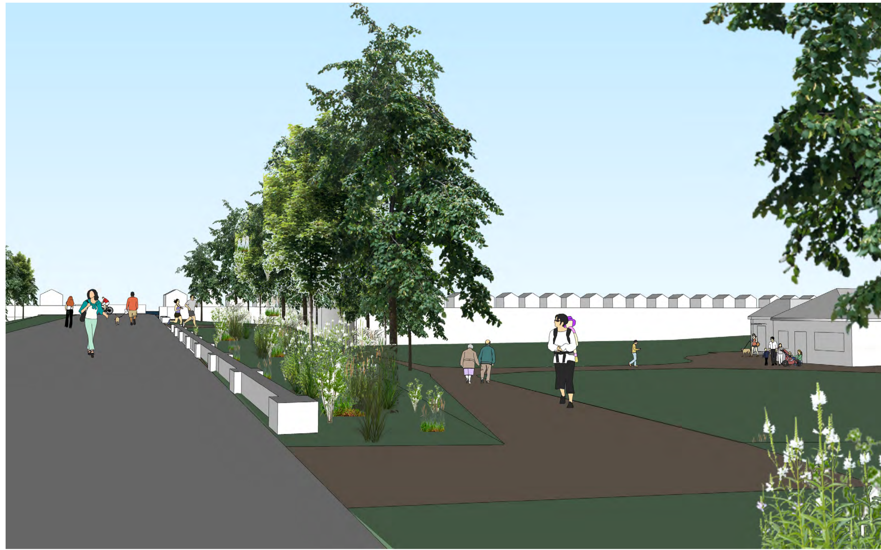
Sketch view from north looking south down a new accessible ramp towards the Big Beach Cafe with the esplanade in the background