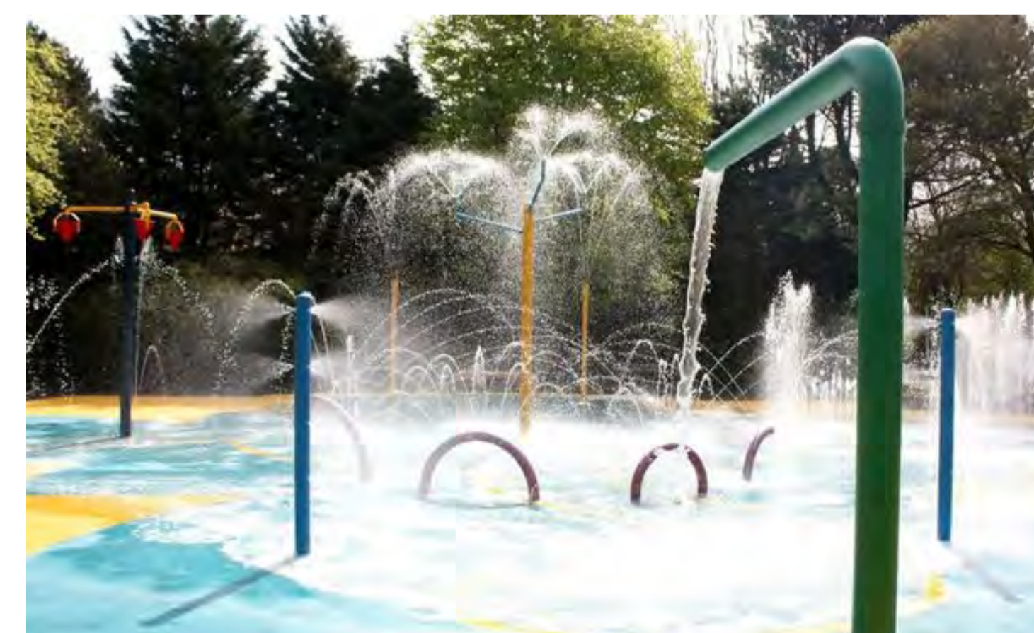
Water play precedents (Happy Mount, Manchester) for Paddling Pool enhancements