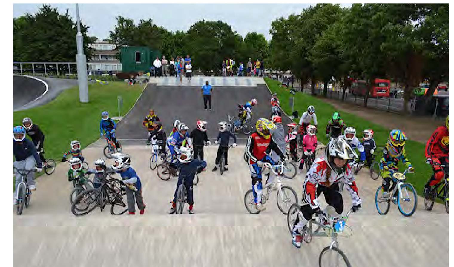
All ages wheeled sports encourages active travel, and better health and well-being